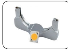
LED Chip & Bridge